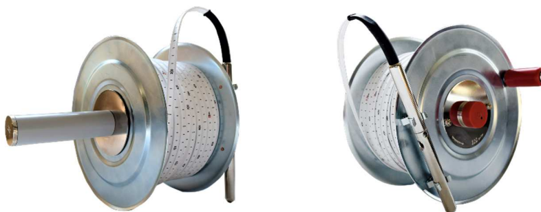
Water Level Meter on big hand-reel with galvanized front-plates 232mm from 60m cable length.