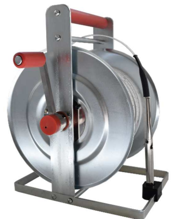
Water Level Meter with galvanized support frame