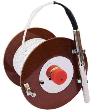
Water Level Meter on hand reel (up to 50m)

The high-precision-measuring-tapes are available with cm/mm markings or feet and 1/100th foot markings.